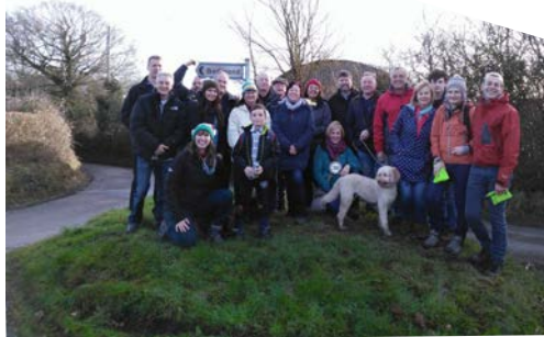
The girls in good voice during the singing