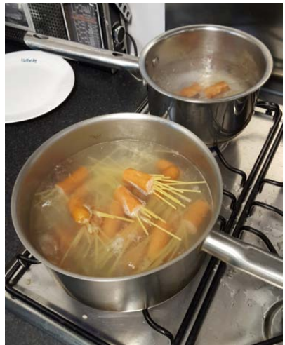
Lauren threading spaghetti through her hotdog.

Lake Beavers had a tasty treat in store for their cooking night. The Beavers tackled the tricky task of threading uncooked spaghetti through hotdog sausages, and then the leaders cooked them ready for tasting. It was decided that the spaghetti and hotdogs were a hit, with all the Beavers having seconds and no leftovers!