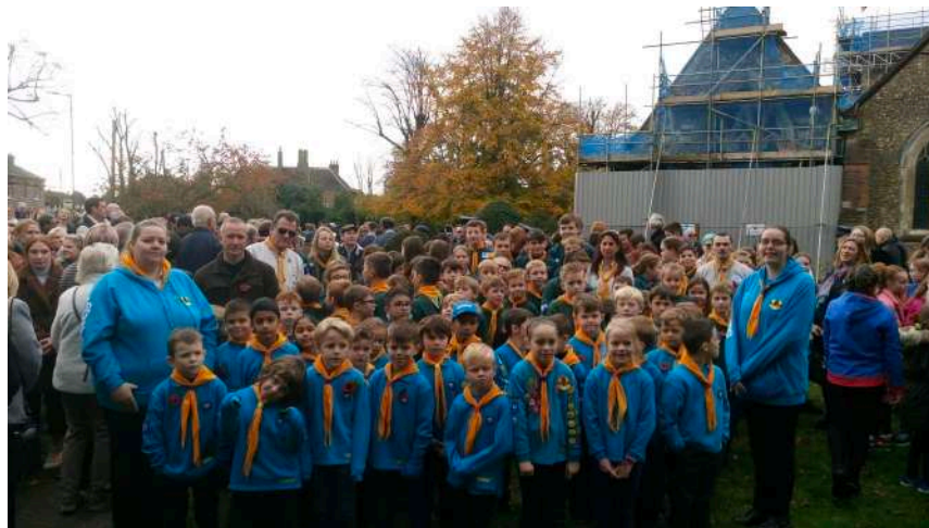
Both Beaver colonies at Remembrance Day 2019