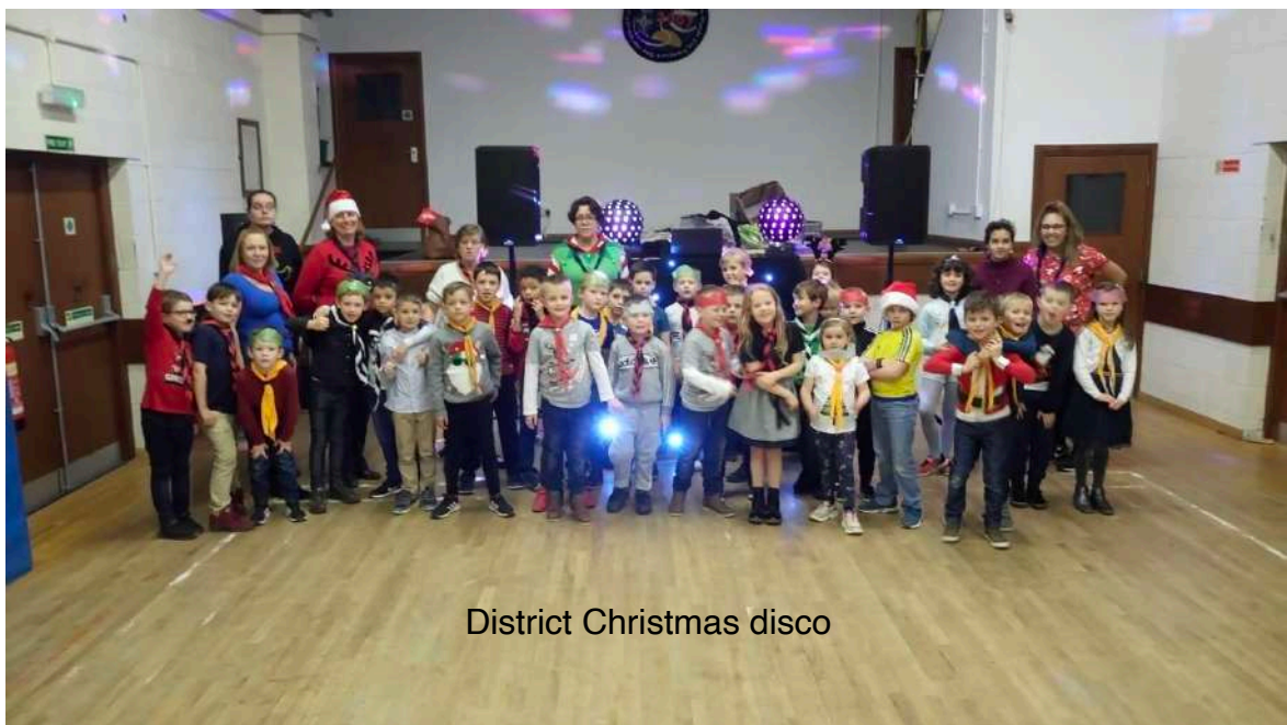
District Christmas disco