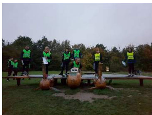
Leavesden Park Group 2

Our brilliant Sixers and Seconders have talked about some of their highlights: