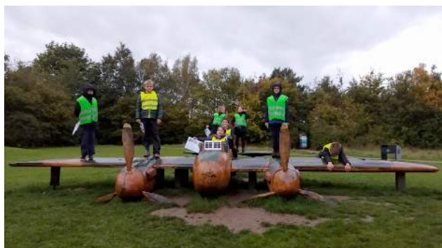
Leavesden Park Group 1