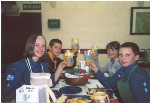
Members of the District cooking competition

2004 was another year of successful scouting in Abbots Langley. The Troop continues to remain full with 38 scouts, with places only offered to Cubs and siblings.