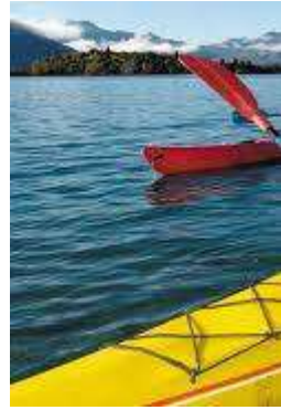
8 second hand Kayaks with