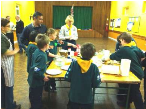
Cubs cooking up a storm on Pancake Day!

After half term we had the customary 'Flippin' Good Fun' evening or Pancake Day to everyone else before kicking off the Air Activities Badge events-the part of the term we were all waiting for!