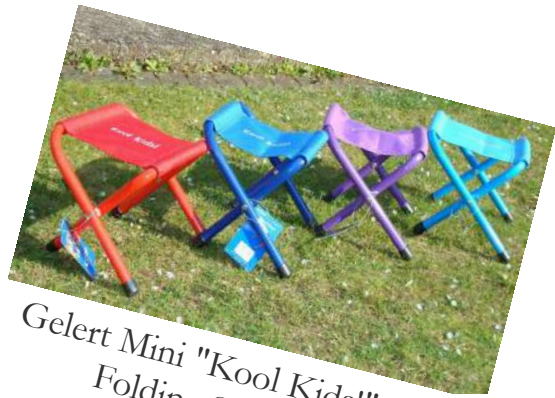
Gelett Mini "Kool Kids!" Folding Stool