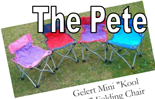
Gelert Mini "Kool Kids!" Folding Chair