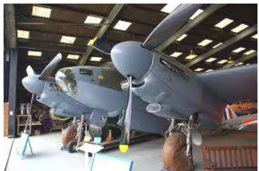
The Mosquito at de Havilland Aircraft Heritage Centre

In early March we visited the Mosquito Aircraft Museum at the De Havilland Aircraft Heritage Centre near Shenley. The museum was the home for the Mosquito design team, part of the de Havilland Aircraft Company and where the prototype was actually