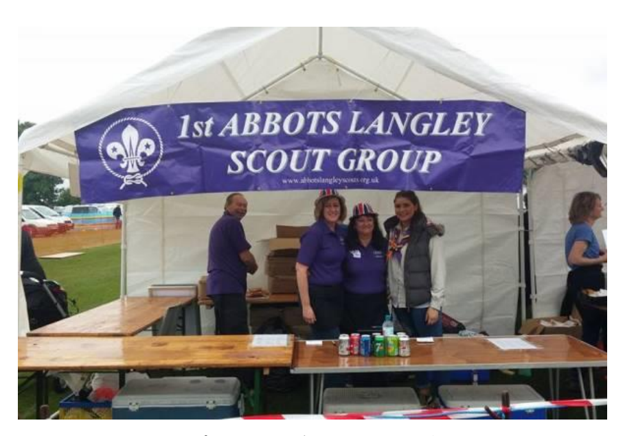
It's Carnival Time again Folks!

Calling all Parents, Beavers, Cubs, Scouts, Explorers, Little brothers and sisters, Grandmas, Grandpas, Uncle Tom Cobbly and Aunt Sally and even the dog! Come and see us at our hot dog stall to raise money for the group. Cheapest hot food at the Carnival Tea and Cakes at the Explorer Stall next door.