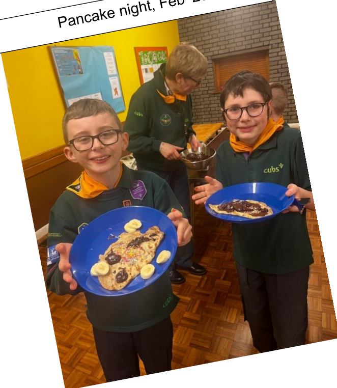
Pancake night, Feb '23

This year Cubs has been really fun. My favourite activities have been the Christmas movie night and going to the fire station. Christmas movie night is always really memorable because the leaders dress up in their smartest clothes, so it is like we are going to a film premier. We get to watch one of the classic Christmas films and eat special Christmas treats with our friends. Everyone is always very excited.