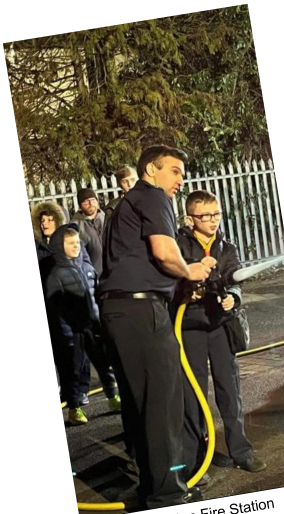
Visit to Garston Fire Station Feb '23

My favourite thing recently was visiting Garston Fire Station because I got to squirt the hose. I also overcame the climbing wall as I have never liked climbing but I did it and it was so much fun.