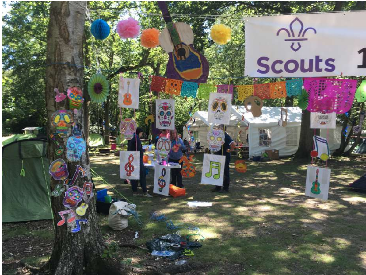
Part of the Coco themed gate with pictures from all of the groups

This year subject was Disney – Pixar movies, ours Groups Theme was Coco. I have never seen Coco before, so I was curious about the movie.