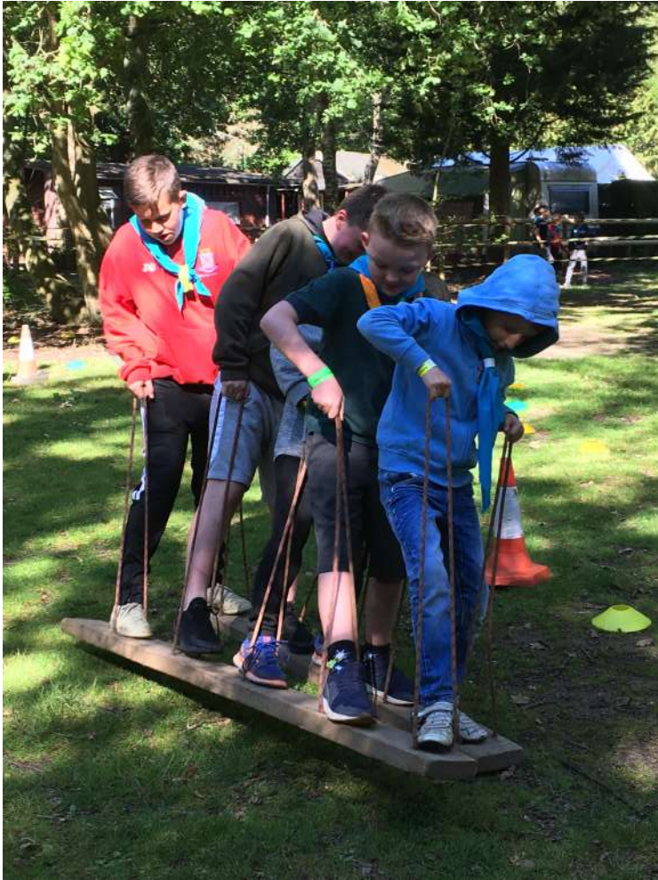
Some participants on the Abbos base at District Camp - Ski Pods. Very concentrated approach to moving the planks around the course.

Pixar's Toy Story was the theme for this base where the toys had to escape across the road under traffic cones.