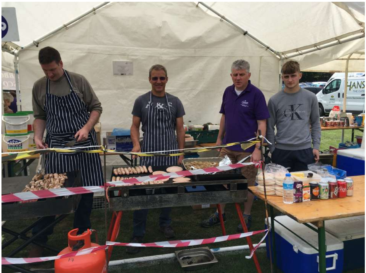
Volunteers on the Carnival sausage sizzling stall