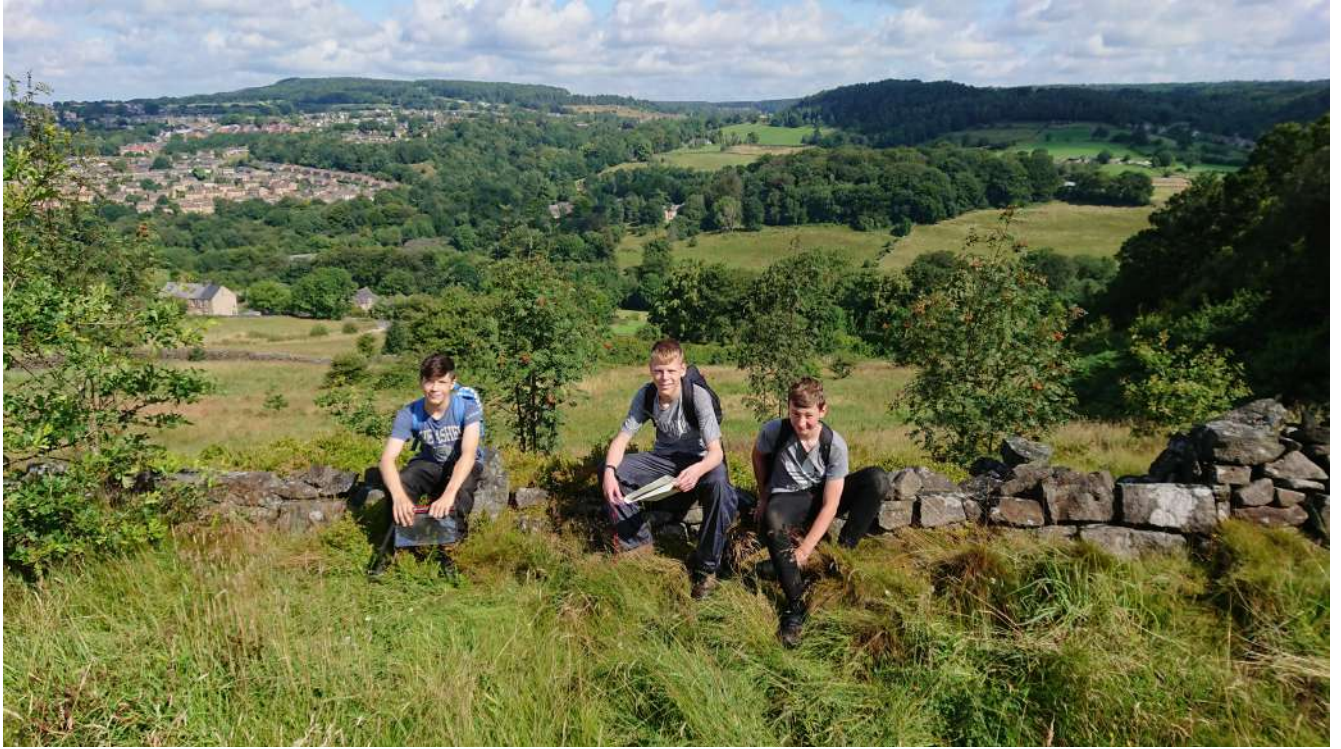
Lovely day for a hike